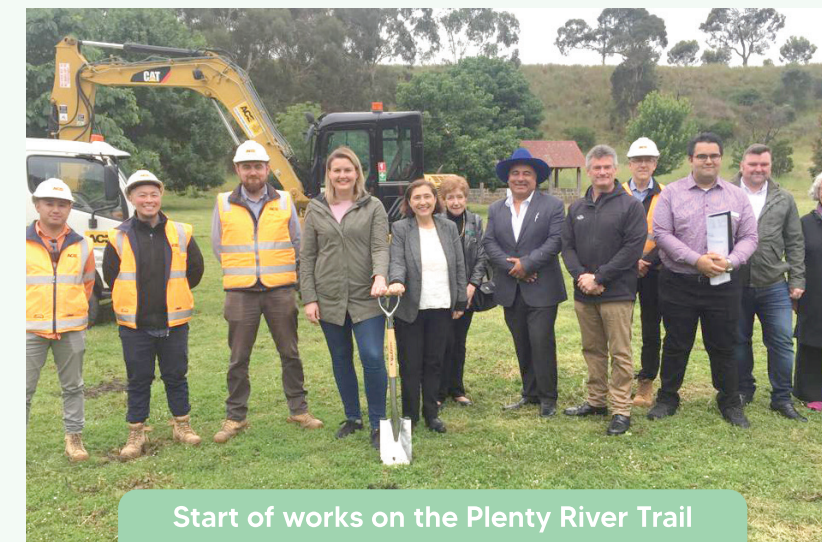
Start of works on the Plenty River Trail