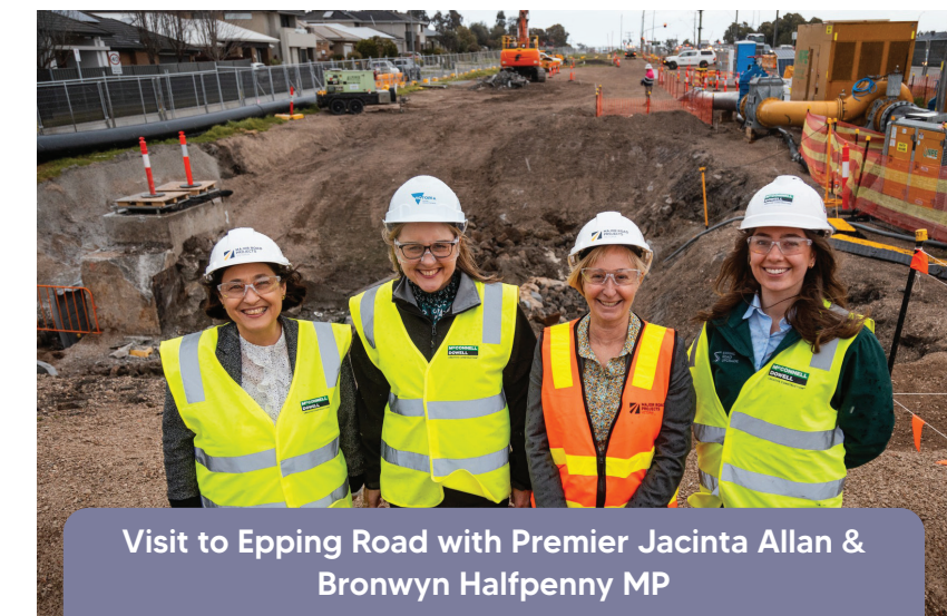
Visit to Epping Road with Premier Jacinta Allan & Bronwyn Halfpenny MP

I know that road works on the Epping Road Upgrade can sometimes inconvenience locals, and I would like to thank road users and residents for their patience while this important project is being built.