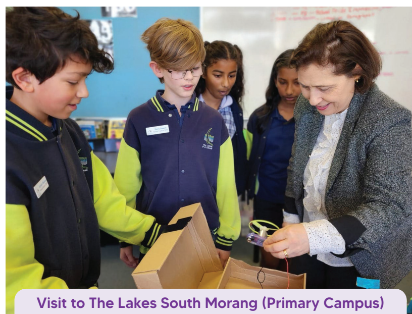
Visit to The Lakes South Morang (Primary Campus)

Visit vic.gov.au/teachthefuture-become-a-teacher