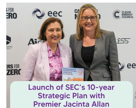
Launch of SEC's 10-year Strategic Plan with Premier Jacinta Allan